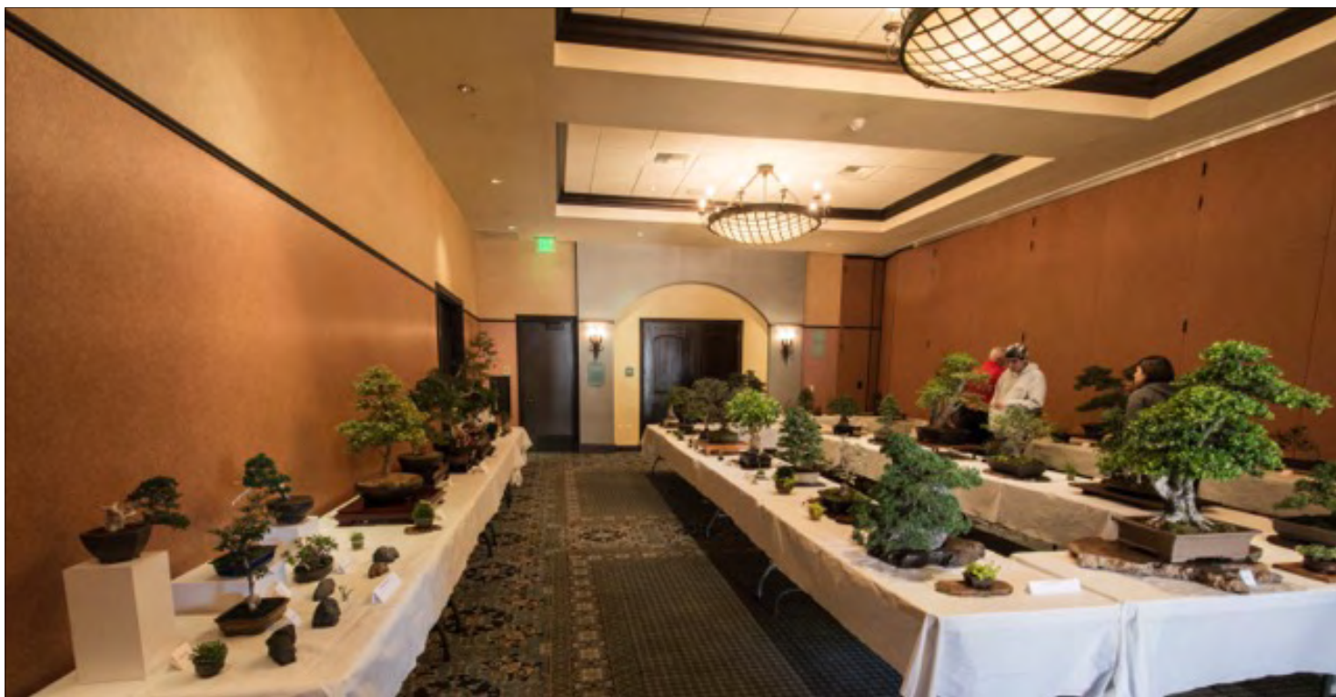
An overview of the exhibit room from near the entrance (above) and a closer view of some of the smaller trees and viewing stones or suiseki (right).