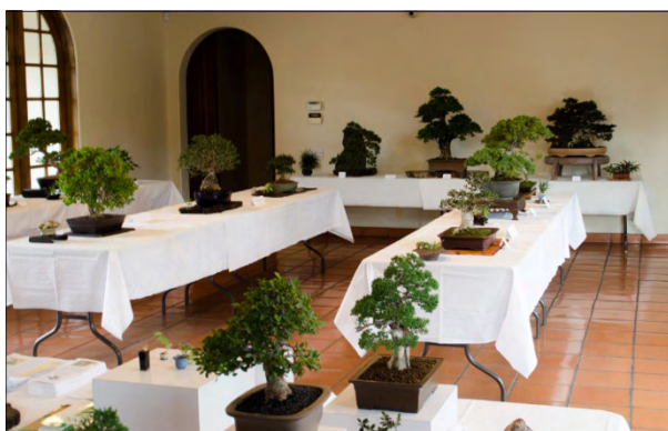
Signage (above left) and the exhibition hall (above).