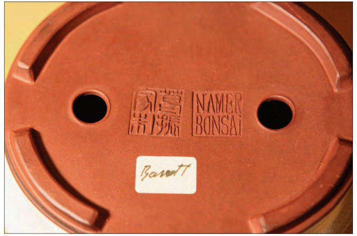
Examples of "chops" on the bottom of pots (top right, right, and below right). A chop from a quality kiln can add significant value to a pot. The second chop on the pot above may be an acceptance chop on a Tokoname pot.

As a potter himself, Barrett said the clays used today are produced in formulae, each formulae designed to produce specific characteristics.